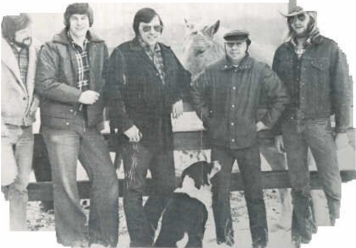
Then and Now